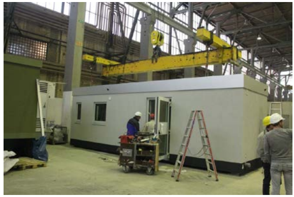
Manufacturing and interior finishing

The security guardhouse is designed and completely pre-manufactured in our facility including the interior fitting allowing for a quick commissioning. It is simply picked up, transported and loaded off on site with only the media supply (water, sewage, electricity) to be connected.