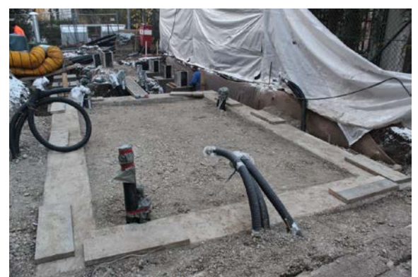
Preparation of the pre-constructed concrete base