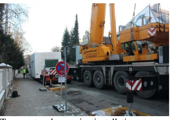
Transport and preparing installation