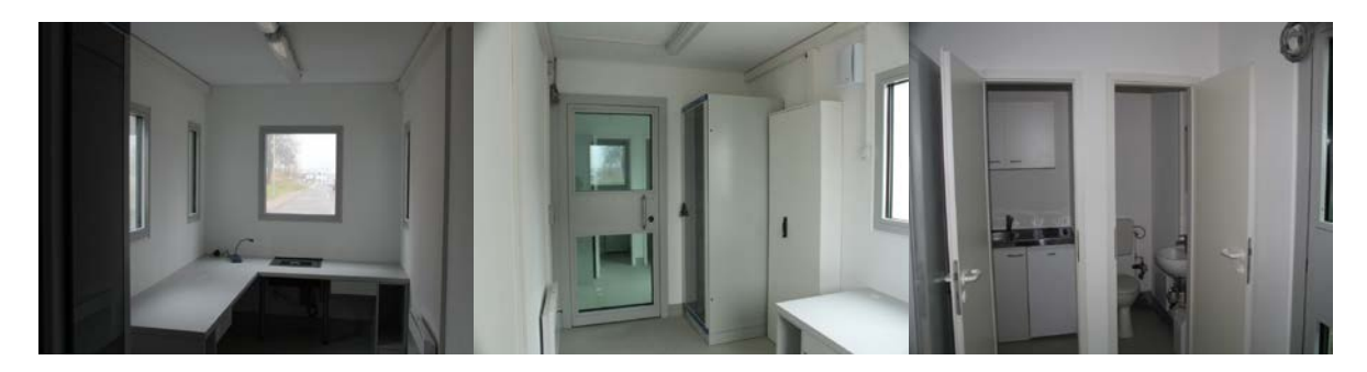
Interior fittings completely pre-manufactured off site