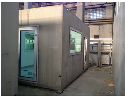
Manufacturing and interior finishing

The security guardhouse is designed and completely pre-manufactured in our facility including the interior fitting allowing for a quick commissioning. It is simply picked up, transported and loaded off on site with only the media supply (water, sewage, electricity) to be connected.