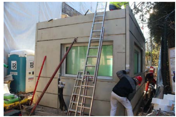
Assembly of the sandwich panels on site