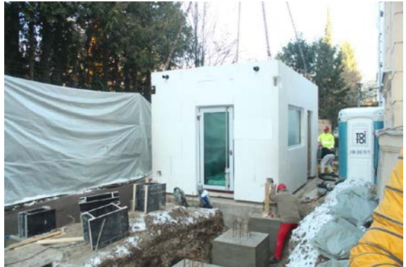
Off-loading and installation on site