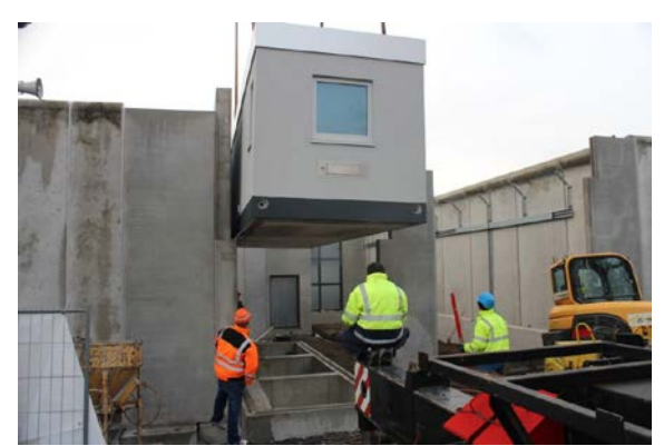
Off loading and installation on site