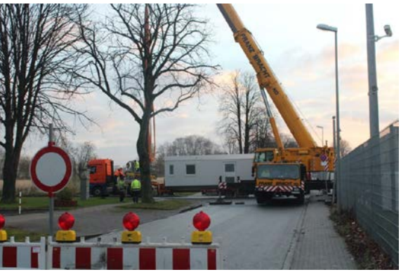
Transport and preparing installation